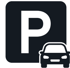
SECURE PARKING camera security, overnight parking available