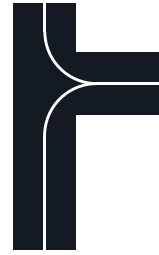
DIRECT TAXIWAY ENTRANCE to main runway