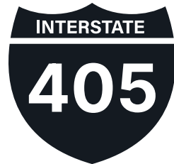
FREEWAY ACCESSIBILITY conveniently located just off of 405, right between two major airports, LAX and SNA