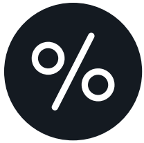
FUEL DISCOUNT custom rates for all tenants