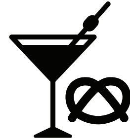
REFRESHMENTS complimentary snacks, drinks, and ice