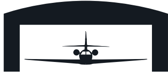
HANGAR DOOR 25.1 FT H BY 99.7 FT W